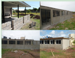
The A&E waiting area under construction at the Lionel Town Hospital.

Patients and visitors at Lionel Town Hospital will soon experience a more comfortable environment, thanks to Jamalco's latest investment in healthcare.