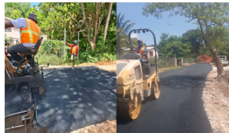
Rehabilitation work underway on the roadway in the community of Munjo.

Residents of the Munro District, popularly known as Manjo, in Reeveswood are expressing delight at the rehabilitation of a key roadway in their community by Jamalco.