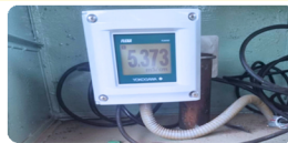
A conductivity meter