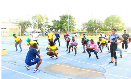
Team members participating in the aerobics workout session.

Jamalco has officially joined the Ministry of Health's Corporate Wellness Challenge, a national initiative aimed at promoting healthier lifestyles in the workplace. Over the next eight months, employees are encouraged to participate in a series of engaging and transformative wellness activities designed to energize both body and mind.