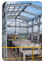
The building which will house TG#4.