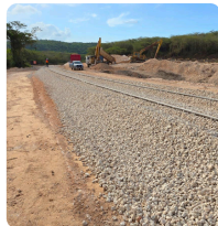
The recently installed rail tracks.

The restoration project was a collaborative effort that brought together several key teams and partners. The CapEx Team managed the overall engineering and execution of the project. Cousins Construction Services Ltd. led the civil works, including demolition and site preparation.