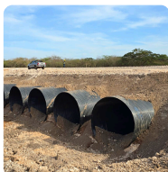
A section of the recently installed 8-pipe culvert structure.

Jamalco has successfully completed major restoration works on a vital culvert that was severely damaged by Hurricane Beryl in 2024. The project, which involved the removal of a temporary fix and the construction of a more robust and permanent structure, was officially completed on July 3, 2025, ahead of the anticipated rainy season.