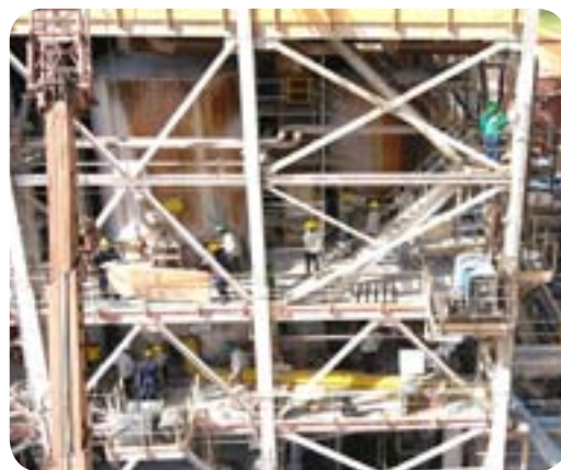
Employees and contractors working on the calciner. #3.

Approximately 237 tons of refractory material was renewed across all areas of the calciner during the overhaul. The main focus included the Furnace, Pre-heat Furnace, and Holding Vessel. A team of around 100 individuals, comprising CMS Coordinators, Reliability Engineers, Planners, Material Coordinators, Mechanical, Electrical, Instrumentation, Civil and Process Maintenance Special-