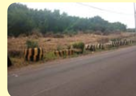
A section of the Halse Hall main road which was debushed recently.

that prioritize the well-being of local communities.