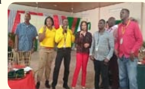
Members of the Corporate Services team entertaining the Council leaders.

In response to the festivities, the Chairpersons of each Community Council shared their Christmas greetings and commended Jamalco for its unwavering support throughout the year. They expressed appreciation for the company's consistent efforts in strengthening community relationships and fostering development.