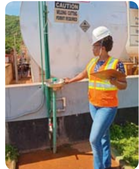
Kadian conducting an above ground inspection of a storage tank.

Her dedication even extends to testing supermarket products to compare them with her own creations. "I am always striving to improve. Going