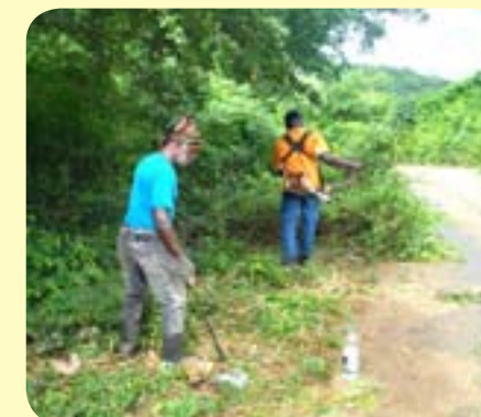
Residents debushing the roadway in the community of Springplain.

The roadway stretching from Mineral Heights to Hayes, and the railway crossings in the Port and Railroad communities, have received a much-needed facelift, thanks to Jamalco's sponsorship of a recent debushing exercise. This initiative has transformed the busy thoroughfare, improving safety and accessibility for motorists and pedestrians alike.