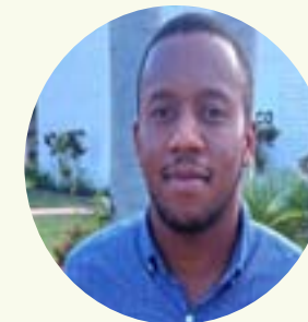
Ackeem Lewis Laboratory

In 2025, I am hoping that persons will pay greater attention to their safety, including the dress code. People need to be more cognizant of hazards and protect themselves. We all just need to be more conscious and maintain or improve our safety records in 2025.