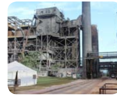
The Calciner Building

within budget and without safety incidents.