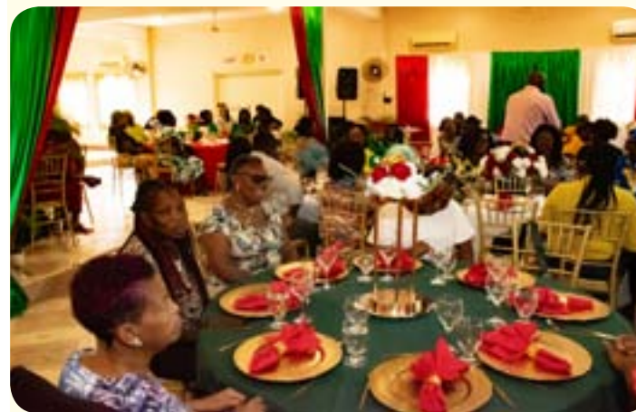
Community Council leaders at the Christmas luncheon.

Some 80 community leaders from Jamalco's operating areas gathered at the Wembley Centre of Excellence in Hayes for the annual Christmas luncheon on Friday, December 13. The event recognized the leaders' support of the company's community development initiatives throughout 2024.